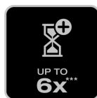
Up to 6 times longer lifetime3)

Construction, dimensions and mechanical compatibility inspired by traditional lamps. For easy and quick installation.