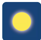
Amber when ON

Thanks to cutting edge interference and absorber coating