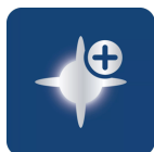
Up to 4,200 Kelvin

Bluish-white light for stylish xenon look