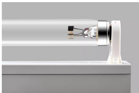
AirZing 5040 Product

PURITEC germicidal lamps emit high-intensity UV radiation that can cause sunburn and conjunctivitis. The skin and eyes must therefore not be exposed to direct or reflected unfiltered radiation.