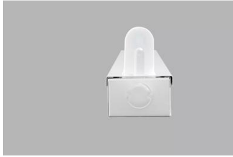
AirZing 5040 Product