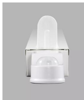
AirZing 5040 Product