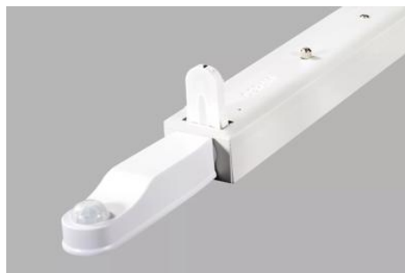
AirZing 5040 Product