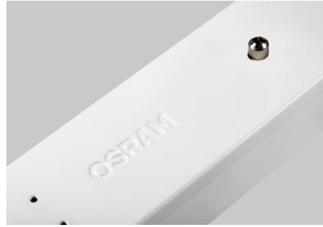
AirZing 5040 Product