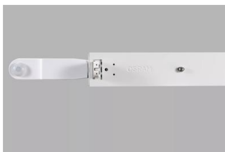
AirZing 5040 Product