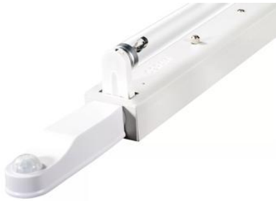
AirZing 5040 Product